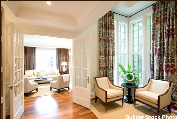
Builder Stock Photo