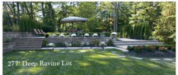
27' Deep Ravine Lot

This prestigious residence has all the PCM signatures of luxury, architectural design and superior construction. PCM creates custom homes in desirable communities of Mississauga and Oakville.